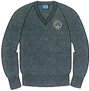
Snr Year 11-12 Grey Pullover With Emb