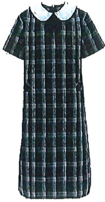
K-4 Girls Summer Check Dress