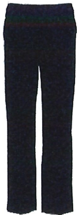
Navy Classic Trousers