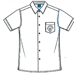
Snr Year 11-12 SS White Shirt With Emb