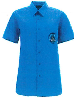
K-10 Boys SS Blue Shirt With Emb