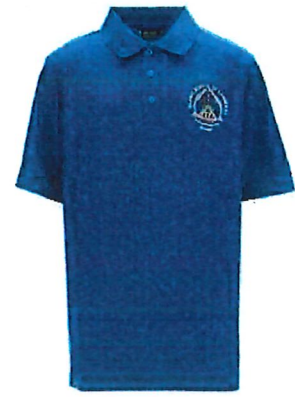
SS Royal Polo With Emb