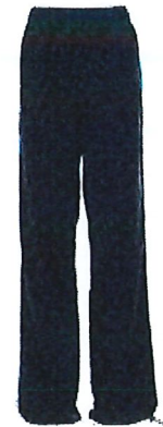
Navy/Gold Sport Trackpants