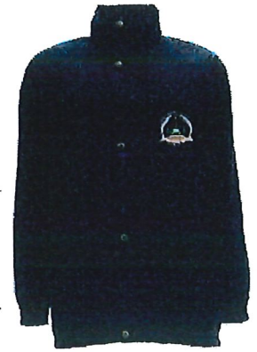
Navy Rain Jacket With Emb