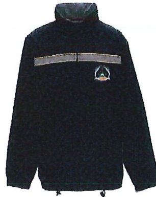
Navy Sport Track Jacket With Emb