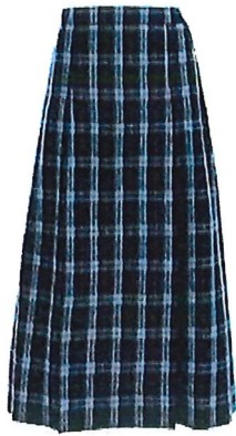
Year 5-10 Girls Navy/Brown Tartan Skirt