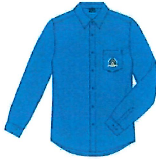
K-10 Boys LS Blue Shirt With Emb