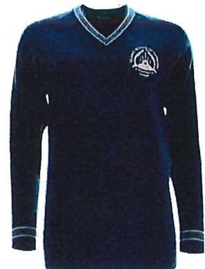
Navy Pullover With Emb