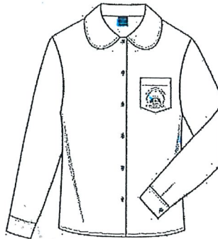
Snr Year 11-12 Girls LS White Blouse With Emb