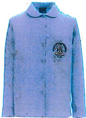
Year 5-10 Girls LS Sky Blouse With Emb