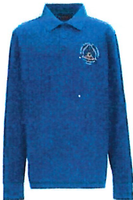
Blue LS Polo With Logo