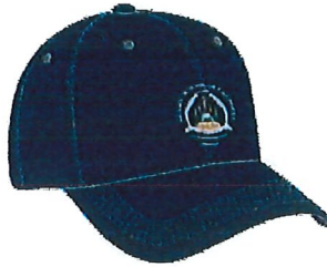
Year 7-10 Navy Cap With Emb